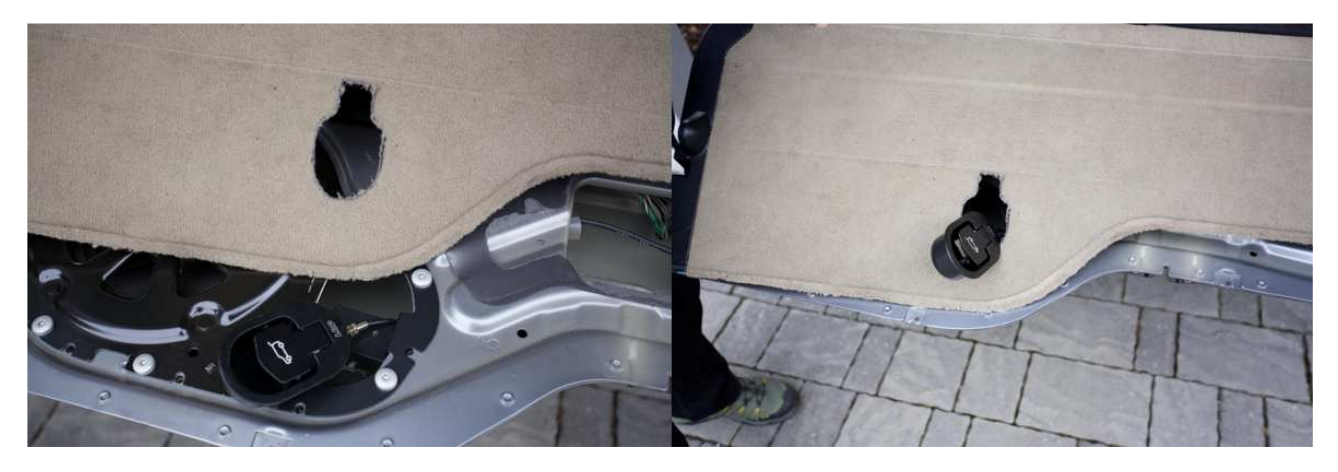
Install the handle to the bracket using the supplied M5x18 screws:

Position the panel trim by letting the handle come out by hole just made and secure it by pressing at the various clips: