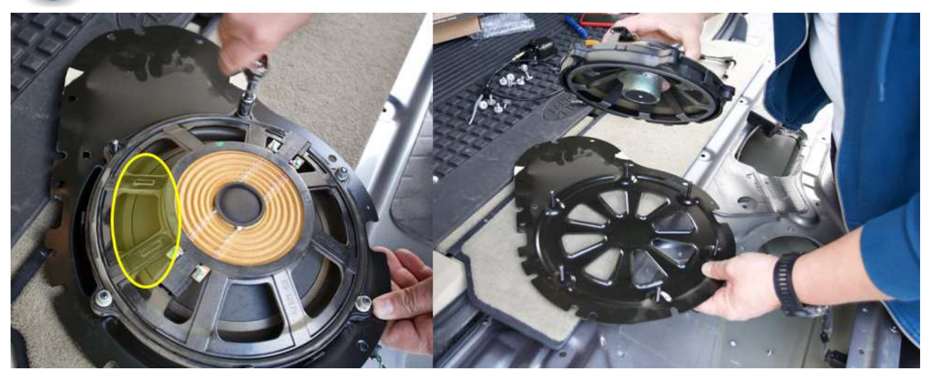
Using the angle grinder cut the subwoofer plate following the cutting line drawn earlier:

Pay attention to the alignment of the subwoofer to the plate so as to reassemble it later in the correct way.